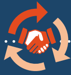
Exhibit Hall Schedule